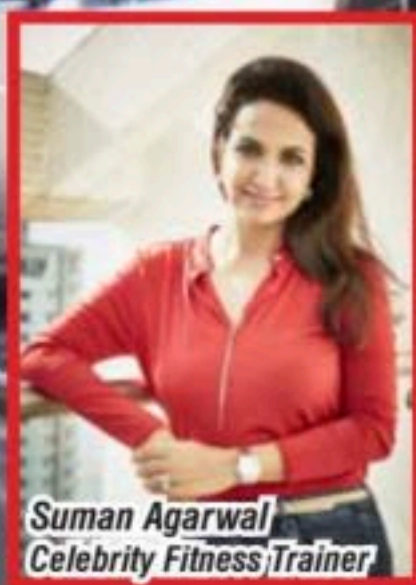
Suman Agarwal Celebrity Fitness Trainer