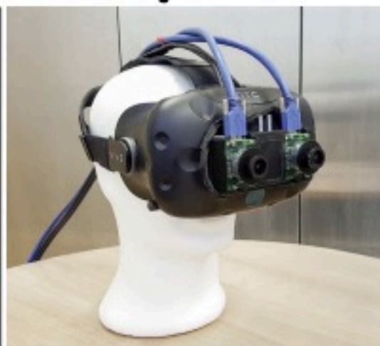
Head-mounted displays used to develop prototypes for medical AR systems. Both head-mounted displays have been developed in Munich – but are not conceived for use in the operating theatre (too many cables, too heavy)