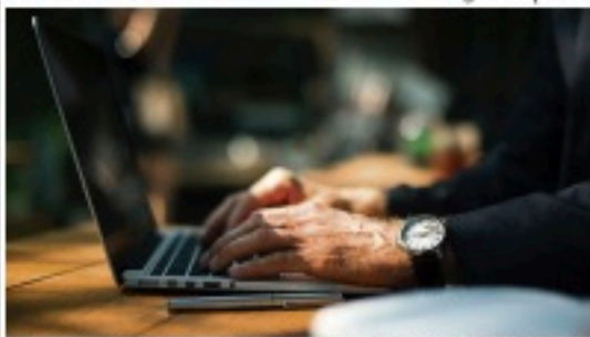
Mobile equipment such as a laptop, is substantial to meet the flourishing demand for a more flexible healthcare service and support healthcare professionals increasingly working out in the field

A challenge IT departments face in supporting a mobile workforce is securing the sensitive and personal information across multiple devices and a widening network, which can mean investing in expensive